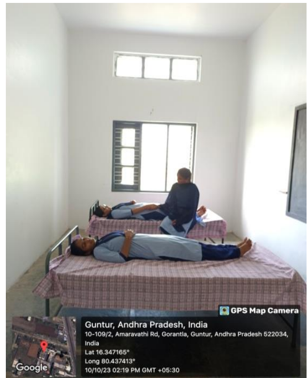
Room No. – 131 - Sick Room with Beds