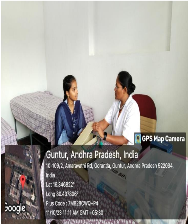
Counselling a student