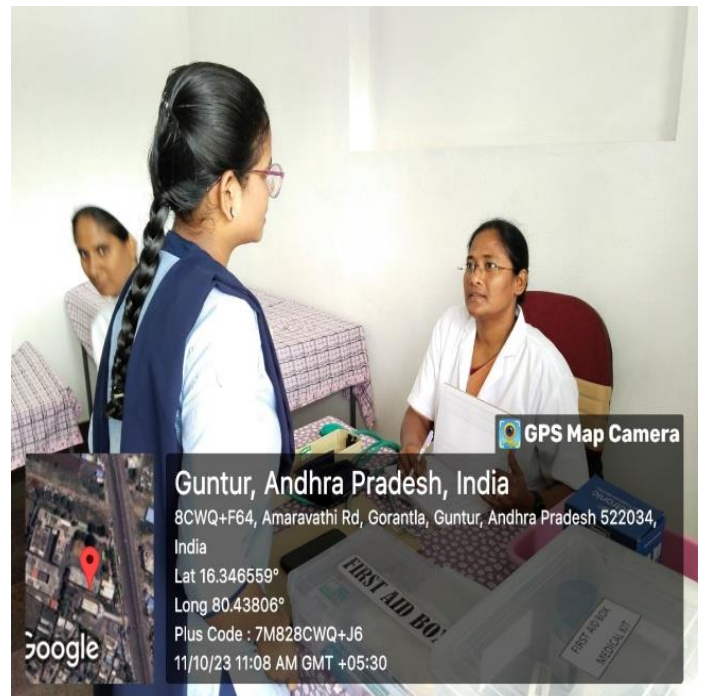
Medical Staff conducting BP test