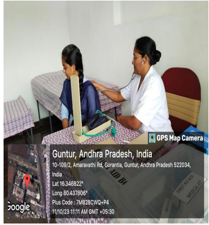
Medical staff testing a student